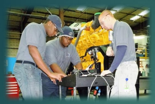
Diesel & Heavy Vehicle Technology